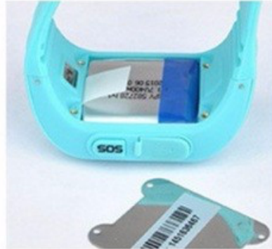
2. Open the battery