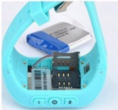
4. Open the metal buckle