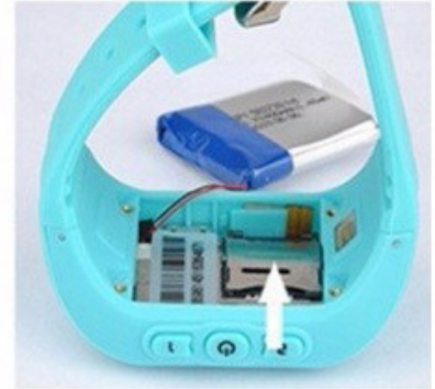
3. Open the cell phone's card slot