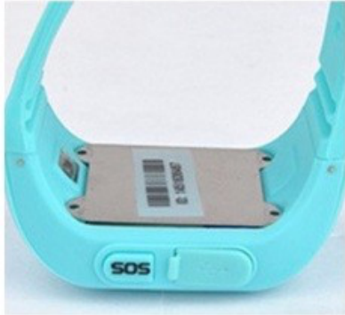
1. Using the screwdriver to unscrew four screws