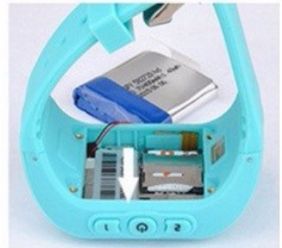
6. Press down the metal buckle