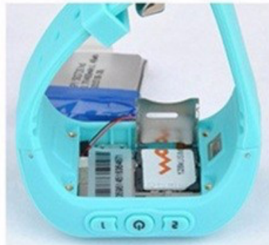
5. Put into a SIM card